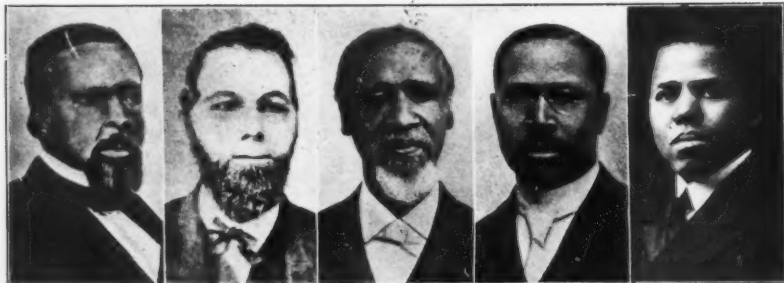
PASTORS OF CONCORD CHURCH, 1847-1927

ness district of Indianapolis, and which for beauty and attractiveness is not outrivalled by any of the stores in this city. Here is a lamp shade factory and store covering thousands of square feet of space, all the work being done by young colored women and men."